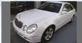
MERCEDES E CLASS - 3 H 180 € / Extra h 50 €