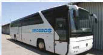
MERCEDES TOURISMO 55 SEATS