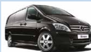
VIP MINI BUS: MERCEDES VITO 9 SEATS