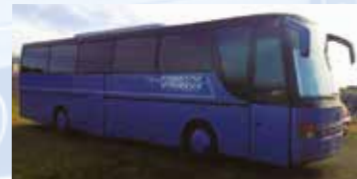
SETRA 53 SEATS - 3 H 220€ / Extra h 60€