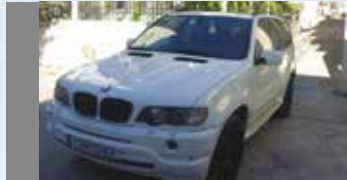
BMW X5 - 3 H 180 € / Extra h 50 €