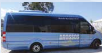
MERCEDES SPRIDER 20 SEATS