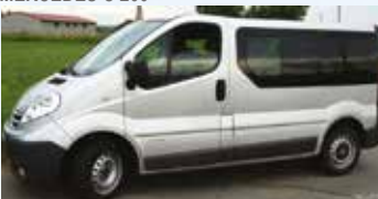
NISSAN PRIMASTAR 9 SEATS