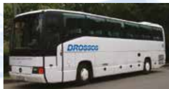
MERCEDES 404 - 57 SEATS