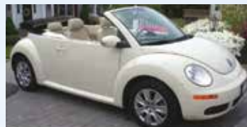
VW BEETLE - 3 H 135 € / Extra h 40 €