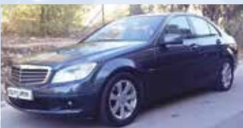
MERCEDES C 200

• 1-3 pax 40,00 € p/s - p/w FOR OIA For extra person 4-8 pax 8,00 € p/p-p/w (Oia)