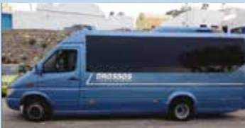
MERCEDES SPRIDER 17 SEATS