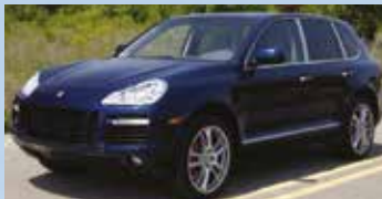
VIP CAR: PORSCH CAYENNE