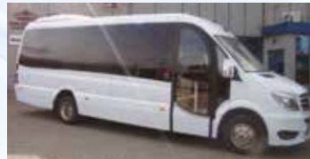
MERC SPRIDER 20 PAX - 3 H 180€ / Extra h 50€