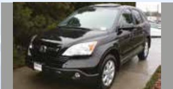
HONDA CR-V - 3 H 150 € / Extra h 45 €