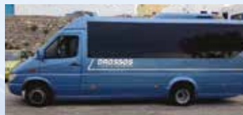
MERCEDES SPRIDER 17 SEATS