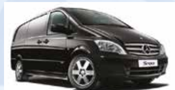
MERC VITO 9 SEATS - 3 H 210 € / Extra h 60 €