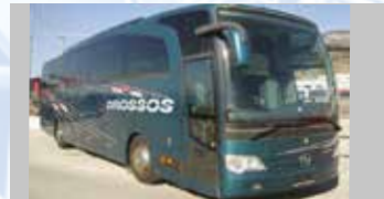
MERC TRAVEGO 50 PAX - 3 H 220€ / Extra h 60€