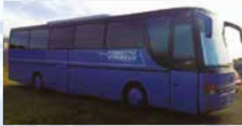
SETRA 53 SEATS