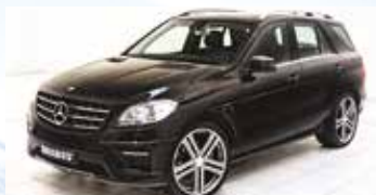
MERC BRAVUS - 3 H 240 € / Extra hour 70 €