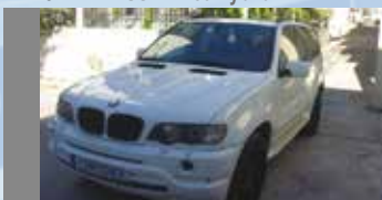
VIP CAR: BMW X5