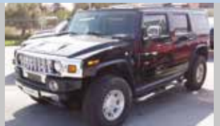
VIP CAR: HAMMER