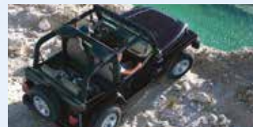
JEEP WRANGLER - 3 H 135 € / Extra h 40 €