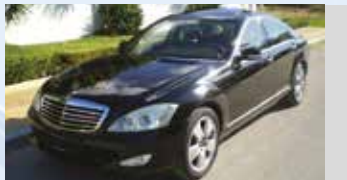
MERCEDES S CLASS - 3 H 240 € / Extra h 70 €