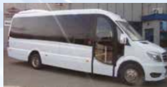
MERCEDES SPRIDER 20 SEATS