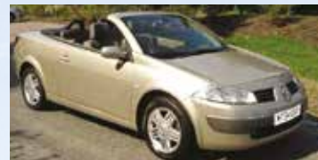
RENAULT MEGANE - 3 H 150 € / Extra h 45 €