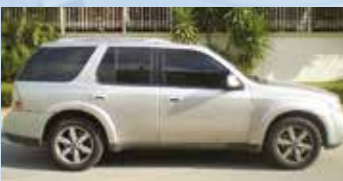
VIP CAR: Saab 9-7X

• 1-3 pax 60,00 € p/s - p/w FOR OIA For extra person 4-8 pax 8,00 € p/p-p/w (Oia)