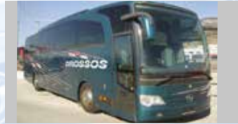
MERCEDES TRAVEGO 50 SEATS

Office (A) Tel.: +30 22860 71492 • Office (B) Tel.: +30 22860 71024