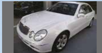
VIP CAR: MERCEDES E CLASS