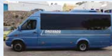
MERC SPRIDER 17 PAX - 3 H 180 € / Extra h 50 €