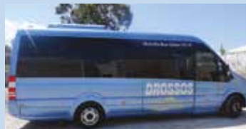
VIP MINI BUS: MERCEDES SPRIDER 20 SEATS