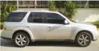
Saab 9-7X - 3 H 180 € / Extra hour 60 €