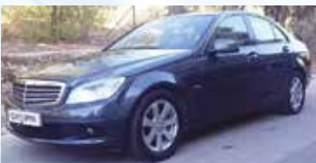
MERCEDES C 200 - 3 H 150 € / Extra hour 45 €