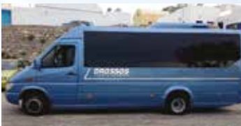
MERCEDES SPRIDER 17 SEATS