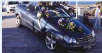
MERCEDES CLK 270 - 3 H 180 € / Extra h 50 €