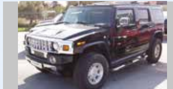
HAMMER - 3 H 240 € - Extra h 70 €