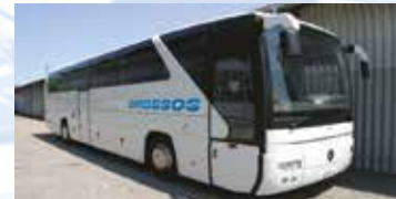
MERC TOURISMO 55 PAX - 3 H 220€ / Extra h 60€