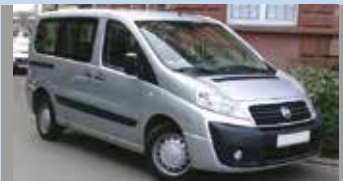
FIAT SCUDO 9 SEATS

• 1-3 PAX 25,00 € PER SERVICE FOR OIA For extra person 4-8 PAX 7,00 € P/P - P/W APT/PORT/HOTEL (OIA)