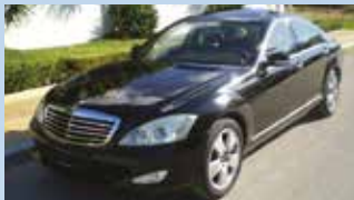
VIP CAR: MERCEDES S CLASS