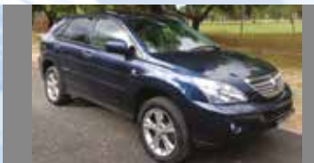
VIP CAR: LEXUS RX 450 Hybrid