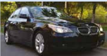
BMW 525 - 3 H 180 € / Extra hour 50 €