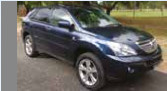
LEXUS RX 450 - 3 Hours 180 € / Extra hour 50 €