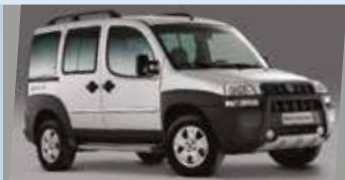
FIAT DOBLO 7 SEATS